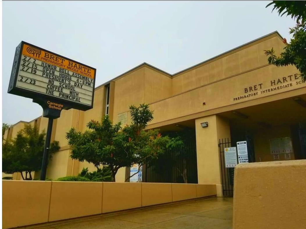
Exhibit C - BOC Presentation Board Report No. 045-25/26

Bond Oversight Committee Meeting September 4, 2025